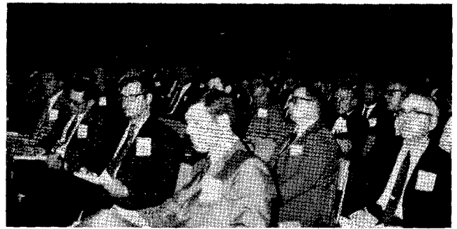
General view of the audience at Military Park Hotel.